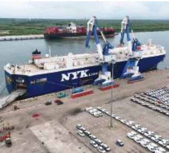
-Article by CNM Department-

On February 27, 2025, the Hambantota International Port (HIP) received its first vehicle shipment since Sri Lanka lifted its import restrictions, with the MV Jupiter Leader delivering 378 vehicles from Japan—196 for the local market and 1,940 for transshipment to Africa. With a strong track record in handling large-scale vehicle imports since 2018, HIP is strategically located and equipped with world-class infrastructure and a skilled workforce, positioning it as a key logistics hub for the automotive sector. As of October 17, 2025, the port has handled a total of 63,489 local import units, reflecting the growing demand and HIP’s readiness to meet it. To support importers and wharf clerks, the port offers designated areas with basic amenities and has established Vehicle Processing Stations to streamline documentation and ensure a smooth transition from port to market. A USD 10 million investment in upgraded infrastructure continues to enhance HIP’s capacity and reinforce its role in driving the growth of Sri Lanka’s automotive industry.