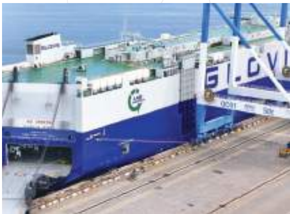
-Article by CNM Department-

The LNG dual-fuel RORO vessel Glovis Selene made its maiden call at Hambantota International Port (HIP), unloading 627 and loading 934 Car Equivalent Units (CEUs) for the Persian Gulf. This marks HIP’s second visit by an LNG dual-fuel vessel, showcasing the port’s readiness for next-generation, eco-friendly shipping. Commissioned in 2024, Glovis Selene is part of Hyundai Glovis’s advanced LNG fleet. With a capacity of 7,000 CEUs, the vessel supports HIP’s growing RORO volumes and Sri Lanka’s maritime trade. Powered by LNG, it reduces harmful emissions and aligns with international environmental standards, contributing to sustainable port operations and global decarbonization efforts.