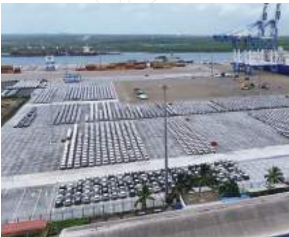
-Article by CNM Department-

Hambantota International Port (HIP) is fully prepared to meet the surge in vehicle imports following the lifting of Sri Lanka’s import ban, backed by advanced infrastructure, a skilled workforce, and a strong track record—handling RORO volumes that grew from 238,997 units in 2018 to 579,362 in 2024. A key feature is its newly designed vehicle import yard, with a capacity for around 4,000 vehicles, equipped with 24/7 CCTV surveillance, strict access control, and international-standard lighting to ensure secure handling of both local and transshipment units. The port also includes a dedicated customs inspection bay, temporary storage areas, and Vehicle Processing Stations to streamline clearance, while providing basic amenities for importers and wharf clerks. A recent USD 2 million infrastructure upgrade further strengthens HIP’s role as a central hub in Sri Lanka’s automotive supply chain.